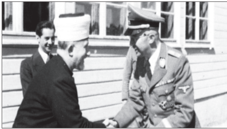
Himmler and the Mufti shaking hands

The archives of the National Library of Israel have revealed another document that attests to a connection between Nazi Germany and Mufti Hajj Amin (Grand Mufti - Page 6)