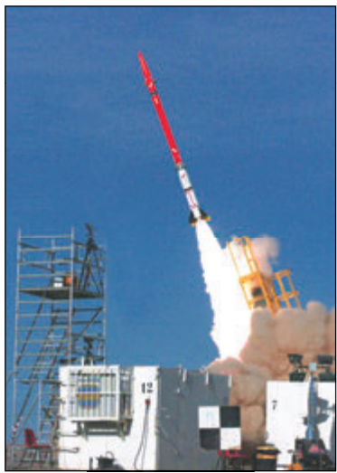
A test of Israel's David's Sling missile defense system in November 2012.