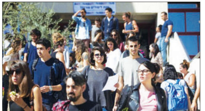
In December 2013, the American Studies Association approved a boycott of Israeli academic institutions, such as the Hebrew University of Jerusalem (pictured).

According to the plaintiffs, the boycott adopted by ASA (Lawsuit - Page 8)