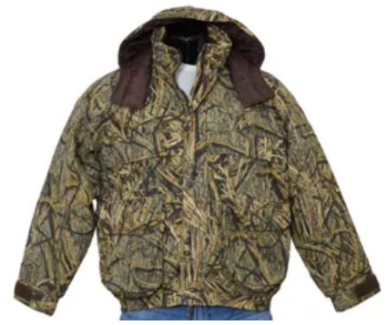
Cabela's Men's Large Bomber Jacket - Multicolor Nylon