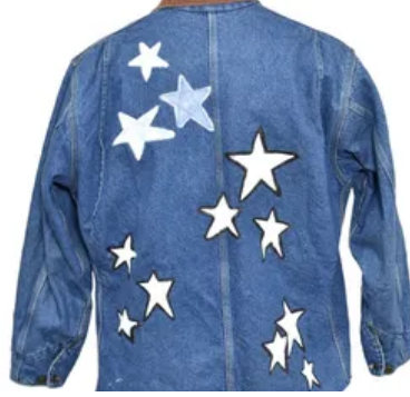
Carhartt Blue Cotton Trucker Jacket Men's XL Button