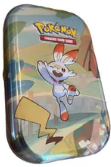
Pokemon Galar Pals Mini Tin Scorbunny #813 XY Evolutions